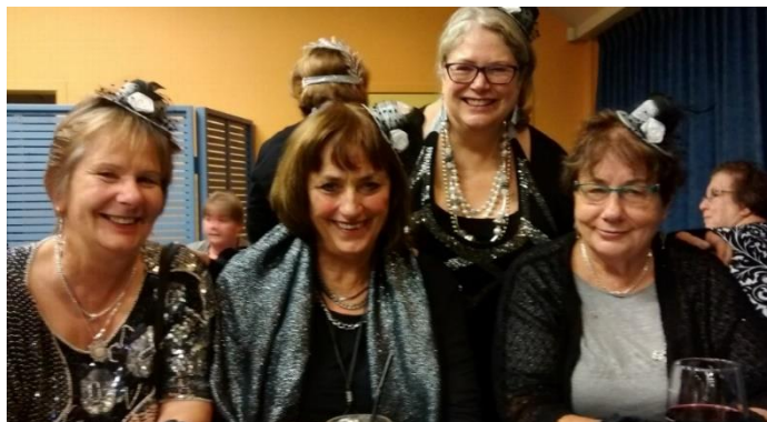
My team celebrating the Silver Anniversary at Hawke's Bay Congress!

My return to NZ was carefully timed so that I could attend the Hawke's Bay Bridge Congress over Queen's Birthday weekend. The HB Congress, which was celebrating its 25 th anniversary, is a well organised and very friendly event. The competition at the higher levels is strong, but there is always the challenge of trying to play your best bridge. And what better way to mark the beginning of winter than with a bridge binge??