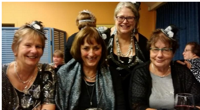
My team celebrating the Silver Anniversary at Hawke's Bay Congress!

My return to NZ was carefully timed so that I could attend the Hawke's Bay Bridge Congress over Queen's Birthday weekend. The HB Congress, which was celebrating its 25 th anniversary, is a well organised and very friendly event. The competition at the higher levels is strong, but there is always the challenge of trying to play your best bridge. And what better way to mark the beginning of winter than with a bridge binge??